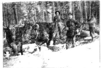
Scene in Northern Wisconsin Pine-land