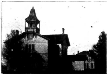
LINCOLN COUNTY COURT HOUSE.