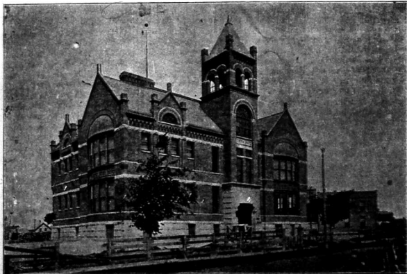
FIFTH WARD SCHOOL HOUSE.