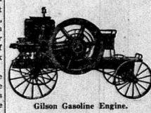
Gilson Gasoline Engine.