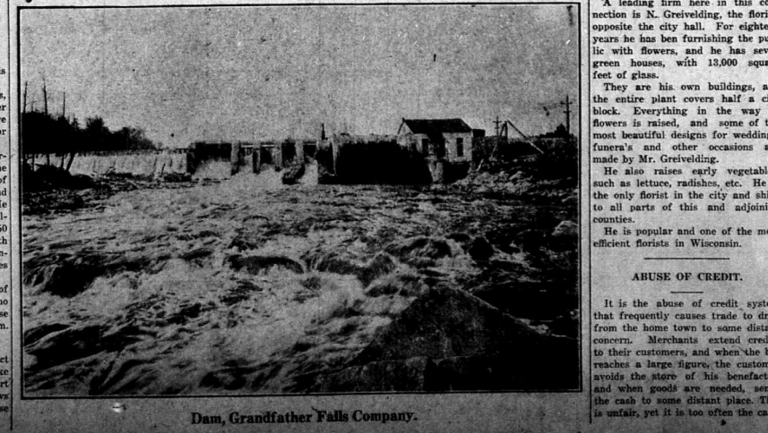
Dam, Grandfather Falls Company.

"A fellow who tries to attract business without advertising is like the fellow who throws his sweetheart a silent kiss in the dark. He knows what he is doing, but nobody else does."