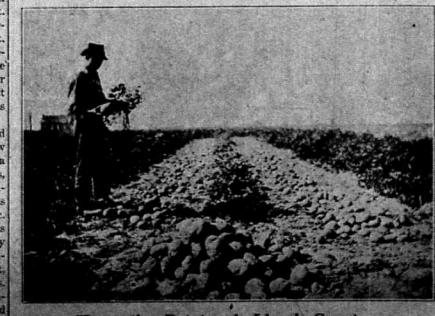
Harvesting Potatoes in Lincoln County.

Through their energy and excellent policies they have built up a large out-of-town trade in potatoes and general produce, shipping in carload lots, chiefly to Chicago and St. Louis. They also buy all kinds of country produce. The firm has established an excellent record in those cities, too.