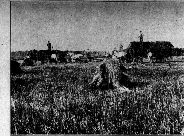
Harvesting in Lincoln County.