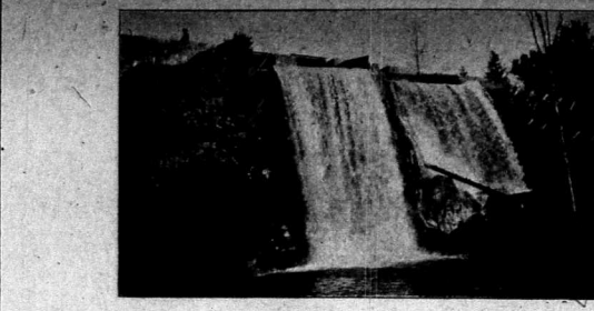
The Dam on Prairie River—Water Power is Unlimited.

You can get a good cigar there, as well as all standard tobaccos. If you wish anything in the way of school