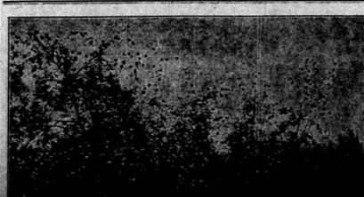
Orchards in Lincoln County.

Well introduced is half sold—Herald Ad is the best introduction.