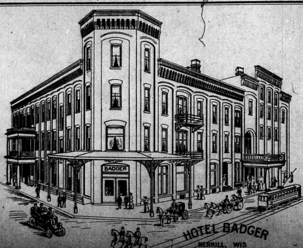
HOTEL BADGER MERRILL, WIS.

There are thousands of readers of the Daily Herald who want your goods. Why don't you tell them what you have.