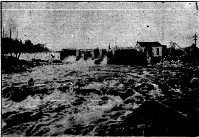
Grandfather Falls Dam, situated about 14 miles northwest of Merrill is one of the several large water power developments in the county. This dam furnishes power to one of Merrill's leading institutions, the Grandfather Falls Co.