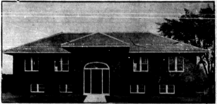
Erected by the local post of the American Legion after a series of entertainments and a final campaign for contributions, this building is being made the nucleus of a property which will in time be beautified into a worthy eastward extension of the Rectory portion of Stange's Park.