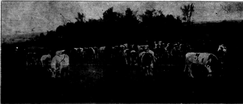
This splendid herd of Holsteins is the property of the Lincoln County home and is one of very excellent foundation herds in the county. Through the selective breeding of pure-bred cattle the county is building its most promising industry, dairying, to a rank where it will compare with any other district in the world.