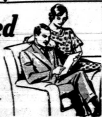
Sincere congratulations to the Herald on a fine record of service.

We ask that you try our cleaning or dyeing service just once. One try and we know you'll use our service all of the time. We use only the finest and most scientific methods... and only expert, experienced men are employed in our establishment. For absolute satisfaction call 49.