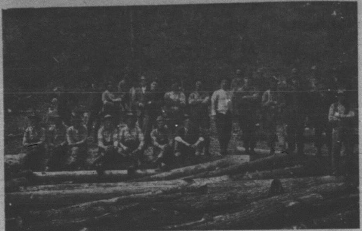
Here is a crew of log drivers ready for a tough d logs moving down the river to the mills. In the hund issue, this was the only picture of the old time log