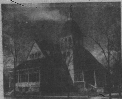
SEVENTH DAY ADVENTIST CHURCH Corner of Third Street and Center Avenue