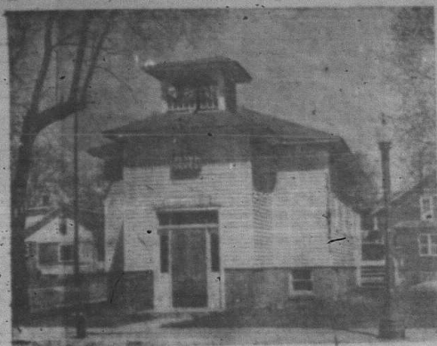
ASSEMBLY OF GOD CHURCH Corner of Second and Hendricks Street