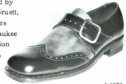
A 1972 Brown & Black Oxford, One of over 200 styles manu- factured today in Merrill.