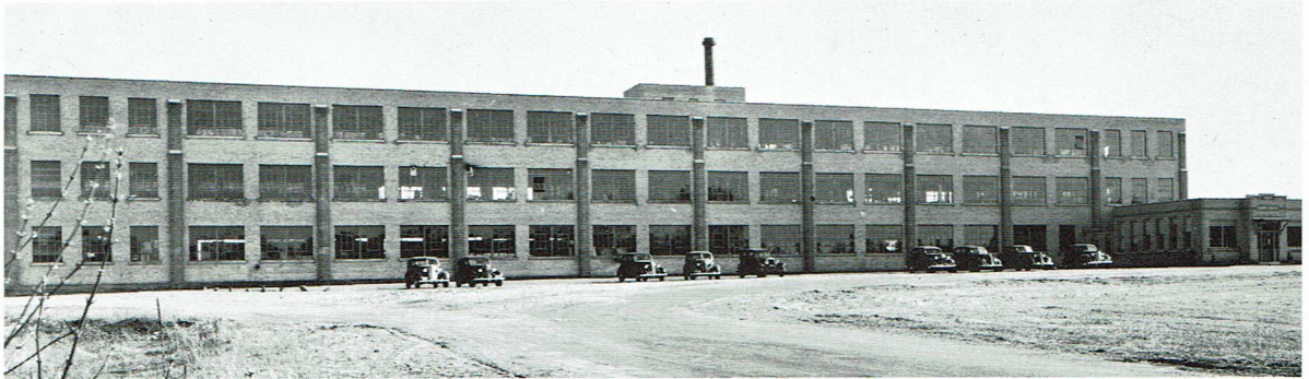
The original Weinbrenner plant in 1937.