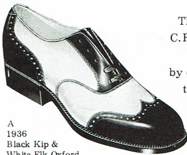
A 1936 Black Kip & White Elk Oxford, one of several models of men's work & dress shoes made in Merrill.