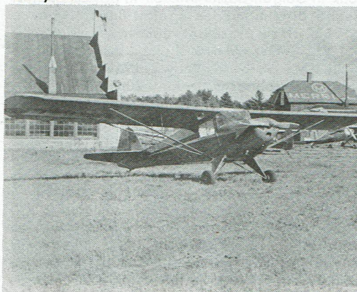
Light planes were popular in the early 50's.

"You ain't nothing but a hound dog cryin all the time" introduced rock-n-roll into this era. Like the song, the Fifties introduced many new aspects to America: an era of McCarthyism, two new states — Alaska and Hawaii, debate concerning U.S. involvement in Asia. Television also comes to Merrill and people are becoming media oriented.