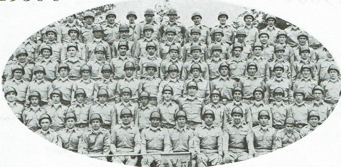
1955 National Guard Camp Mc Coy encampment.